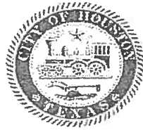
EXHIBIT "D" MWBE REQUIREMENTS