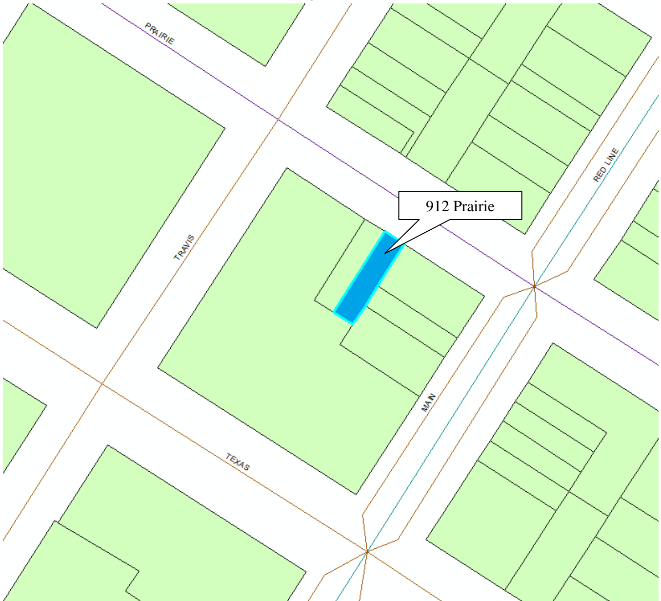
EXHIBIT E SITE MAP THE SCHOLIBO BUILDING 912 PRAIRIE STREET