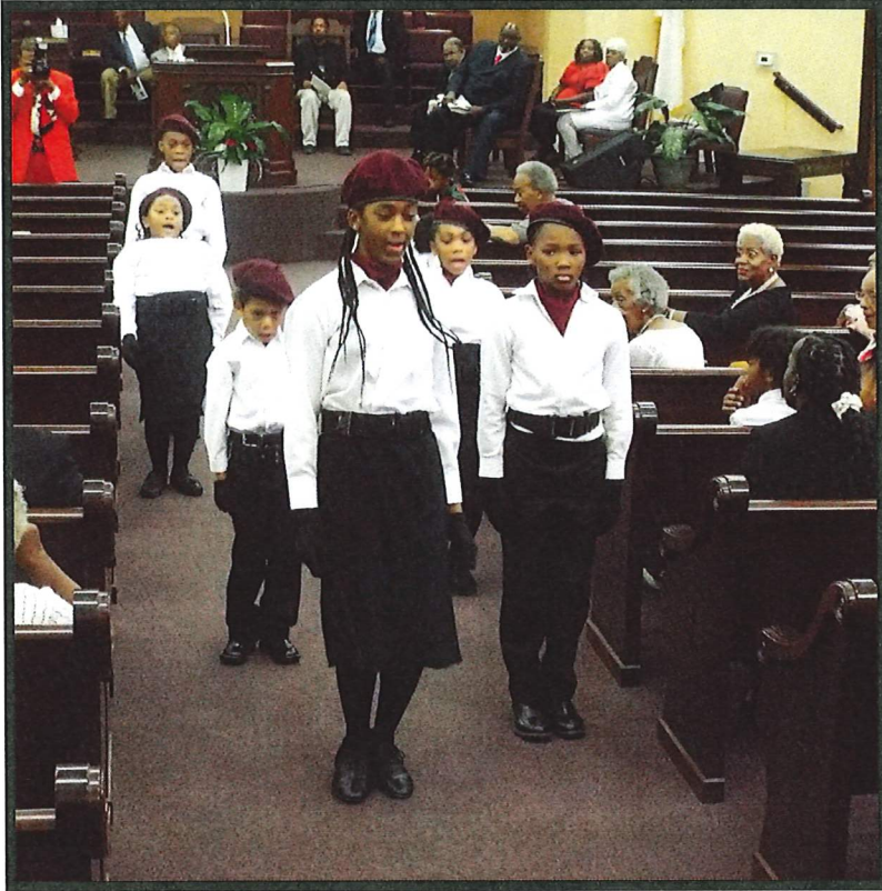
Gulf Coast Drill Team Association