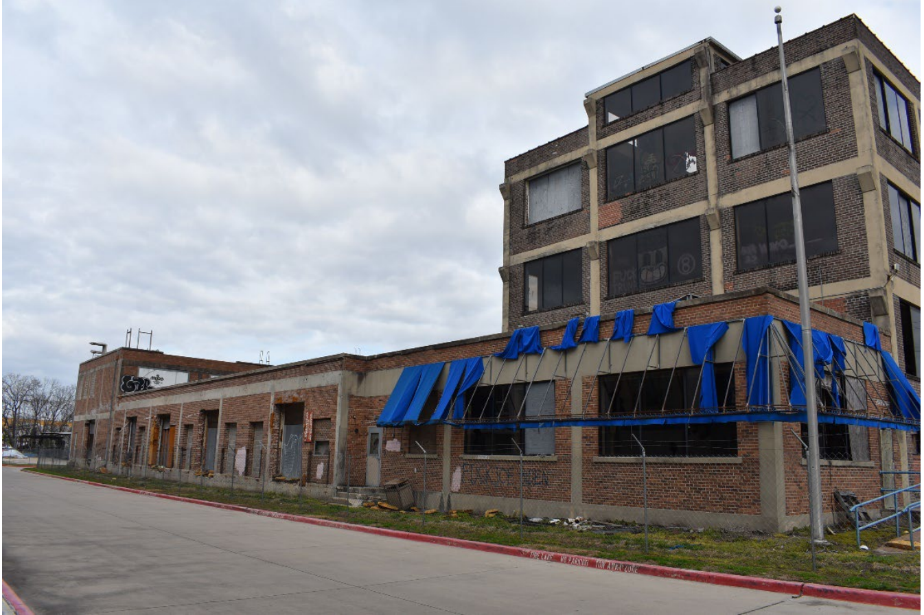
Photo 7 Swift & Co. Packing Plant; Southeast corner; view northwest