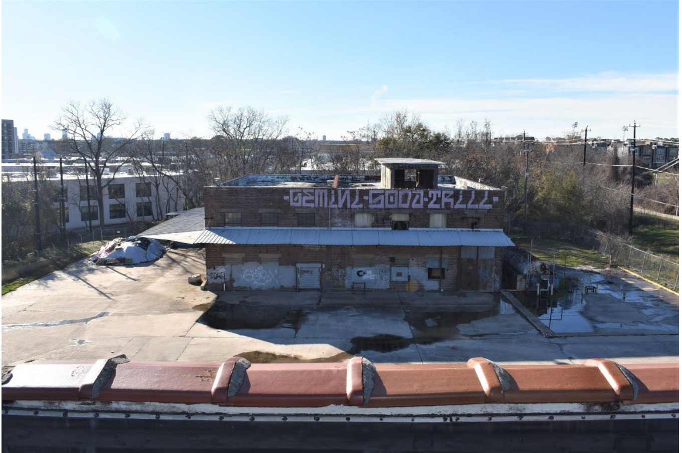
Photo 8 Boiler and Engine House; East elevation; view from roof (rear) of main building, west