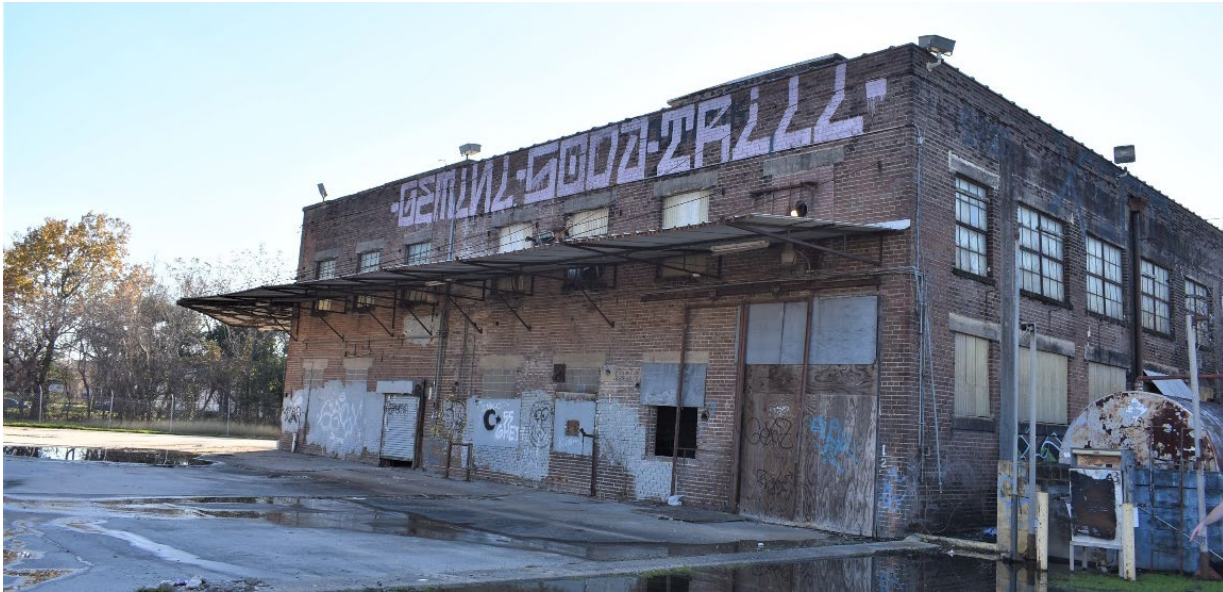
Photo 25 Boiler and Engine House; East elevation, northeast corner; view southwest