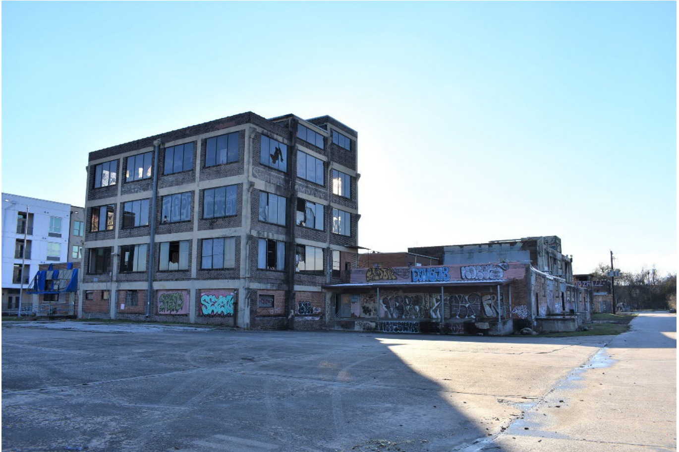
Photo 1 Swift & Co. Packing Plant; East and north elevations; view southwest