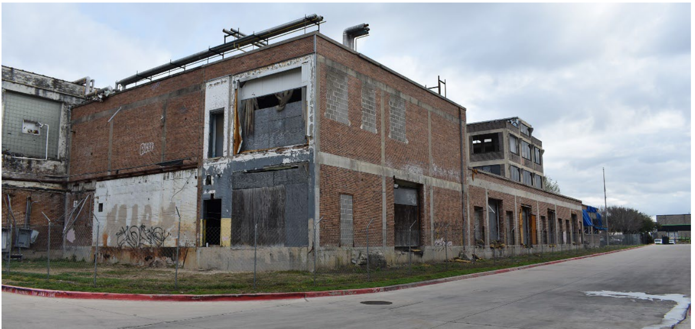
Photo 6 Swift & Co. Packing Plant; Southwest corner; view northeast