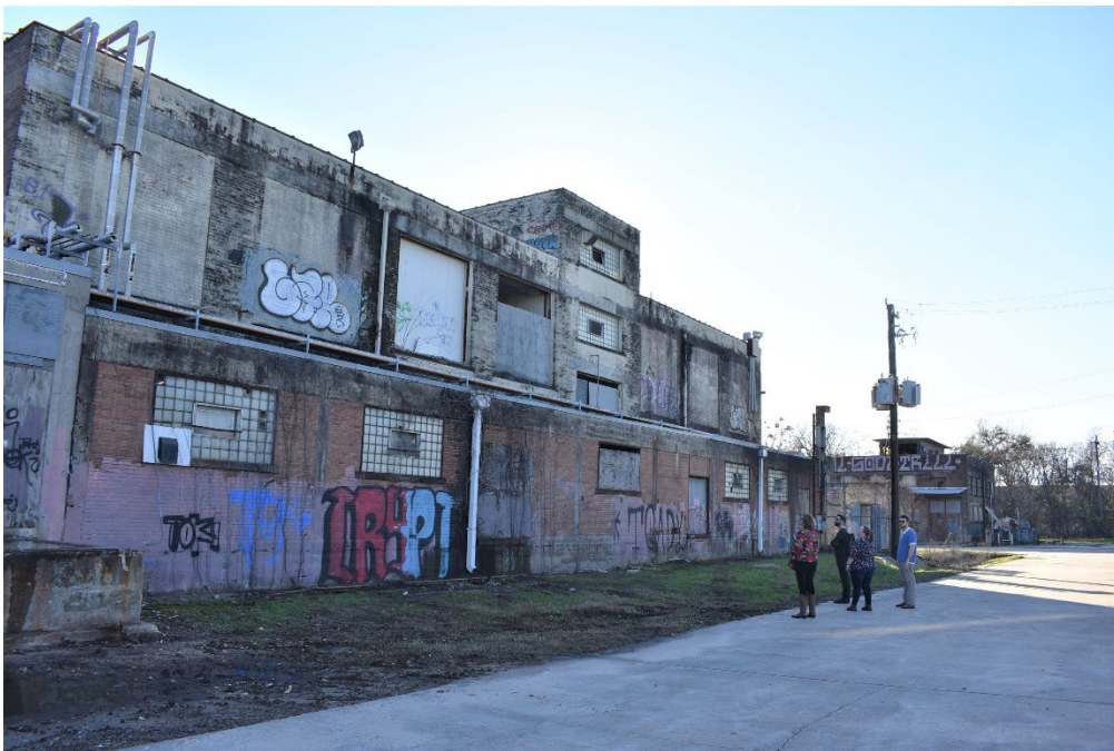
Photo 4 Swift & Co. Packing Plant; North elevation; view southwest