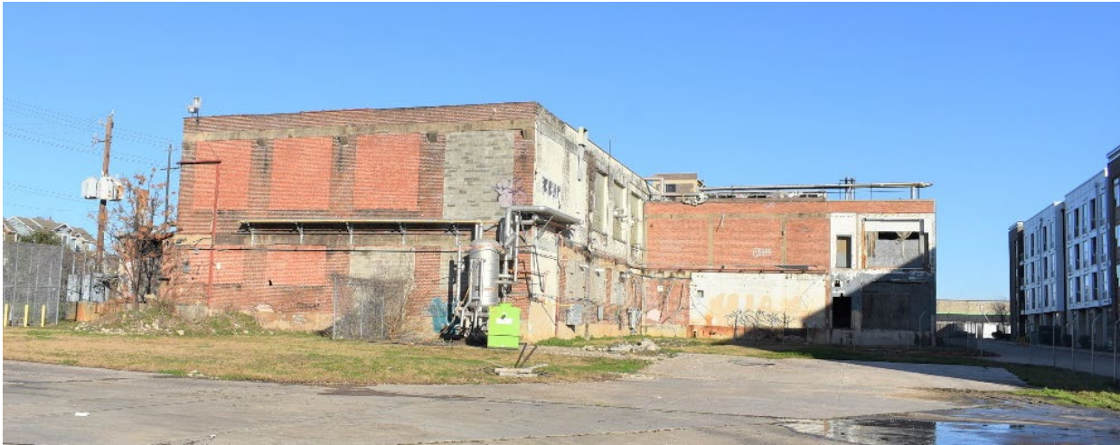
Photo 5 Swift & Co. Packing Plant; West elevation (rear); view northeast