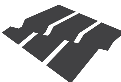
Barbara Quattro Chair