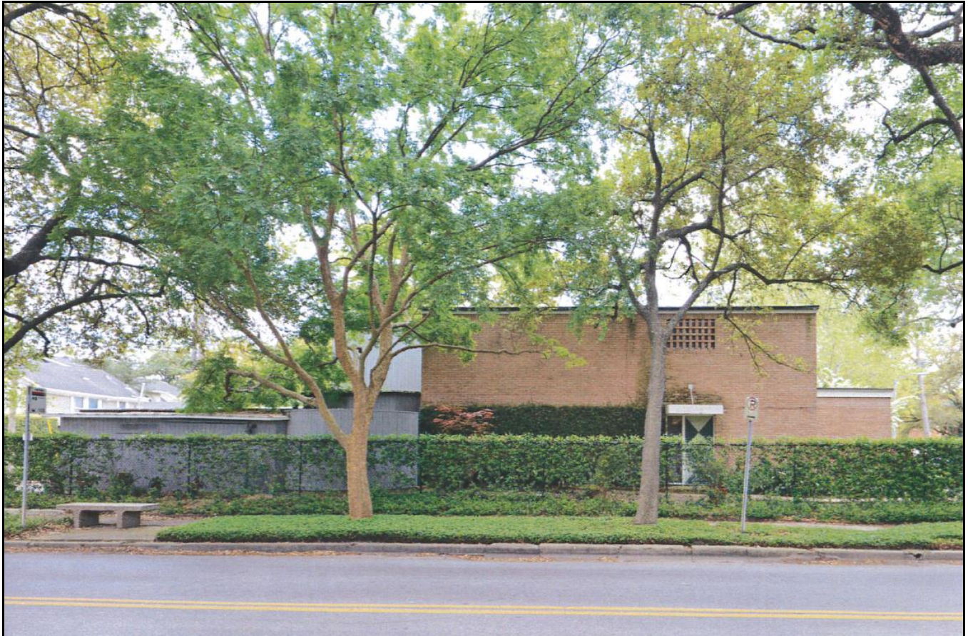
Morris House, North side looking south from Bissonnet Street. March 31, 2015.