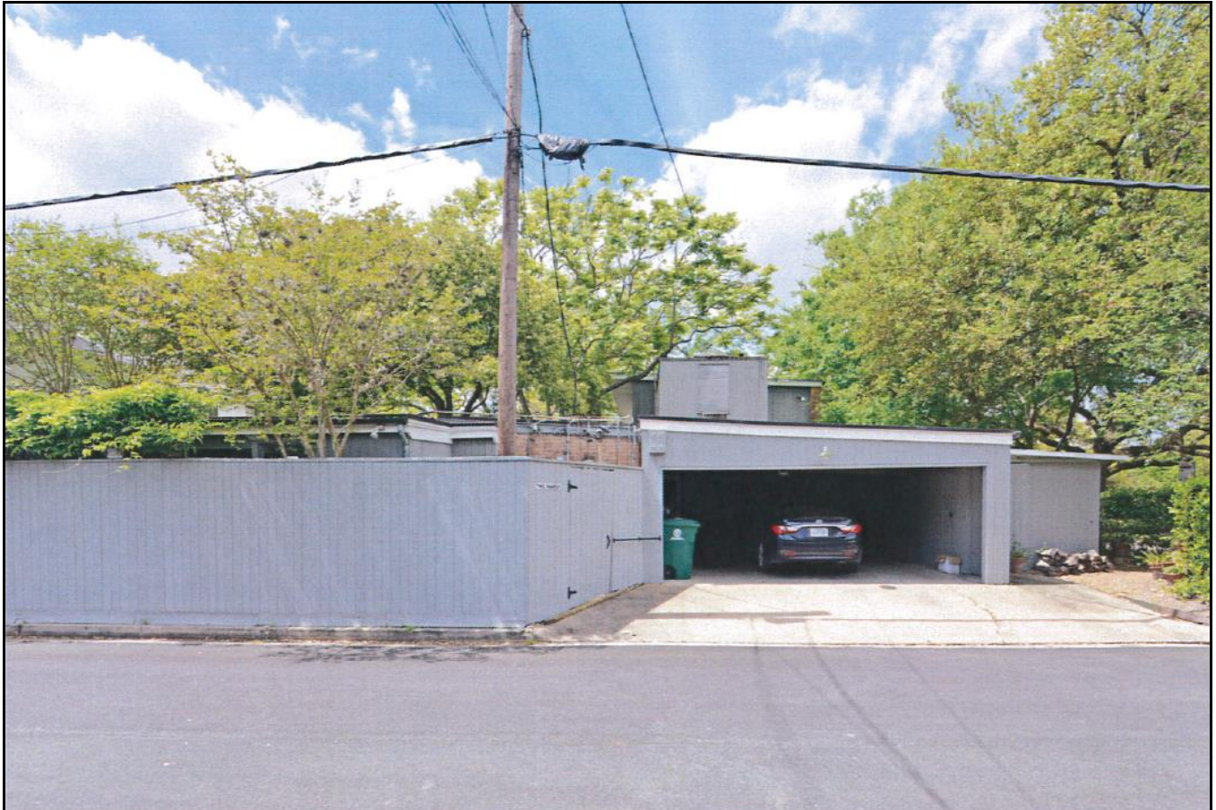
Morris House, East (back) side looking west from Yoakum. March 31, 2015.