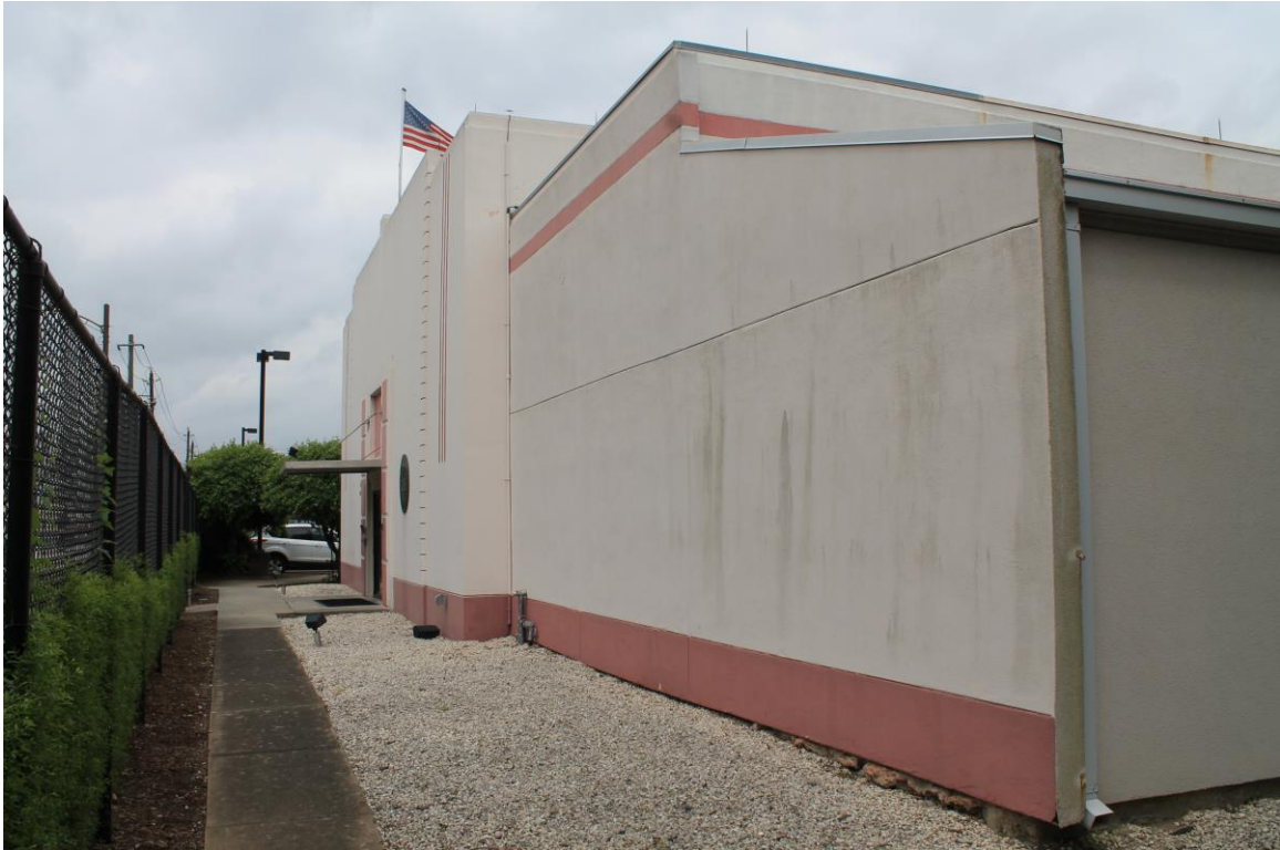
Photo of existing east addition Staff photo, April 3 rd 2015