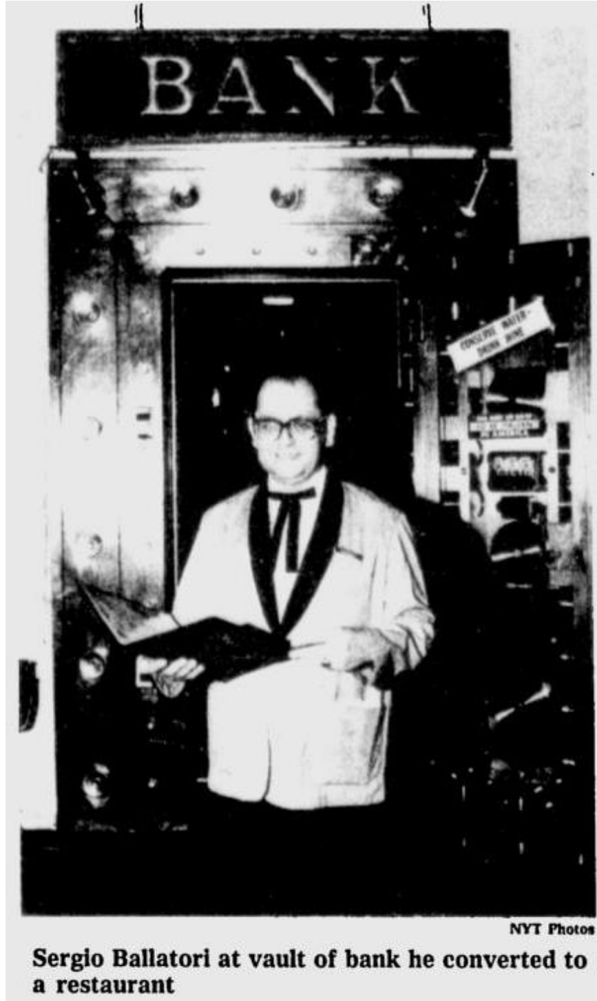
EXHIBIT C HISTORIC PHOTOS AND DRAWINGS EAST END STATE BANK BUILDING 4215 LEELAND STREET