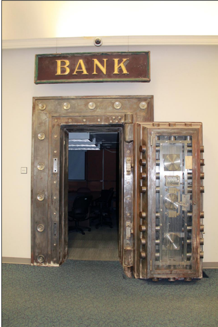
Photo of interior bank vault door, April 3 rd 2015