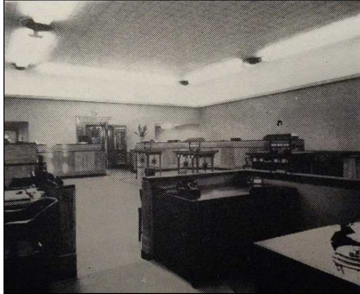
Interior Photo Detail