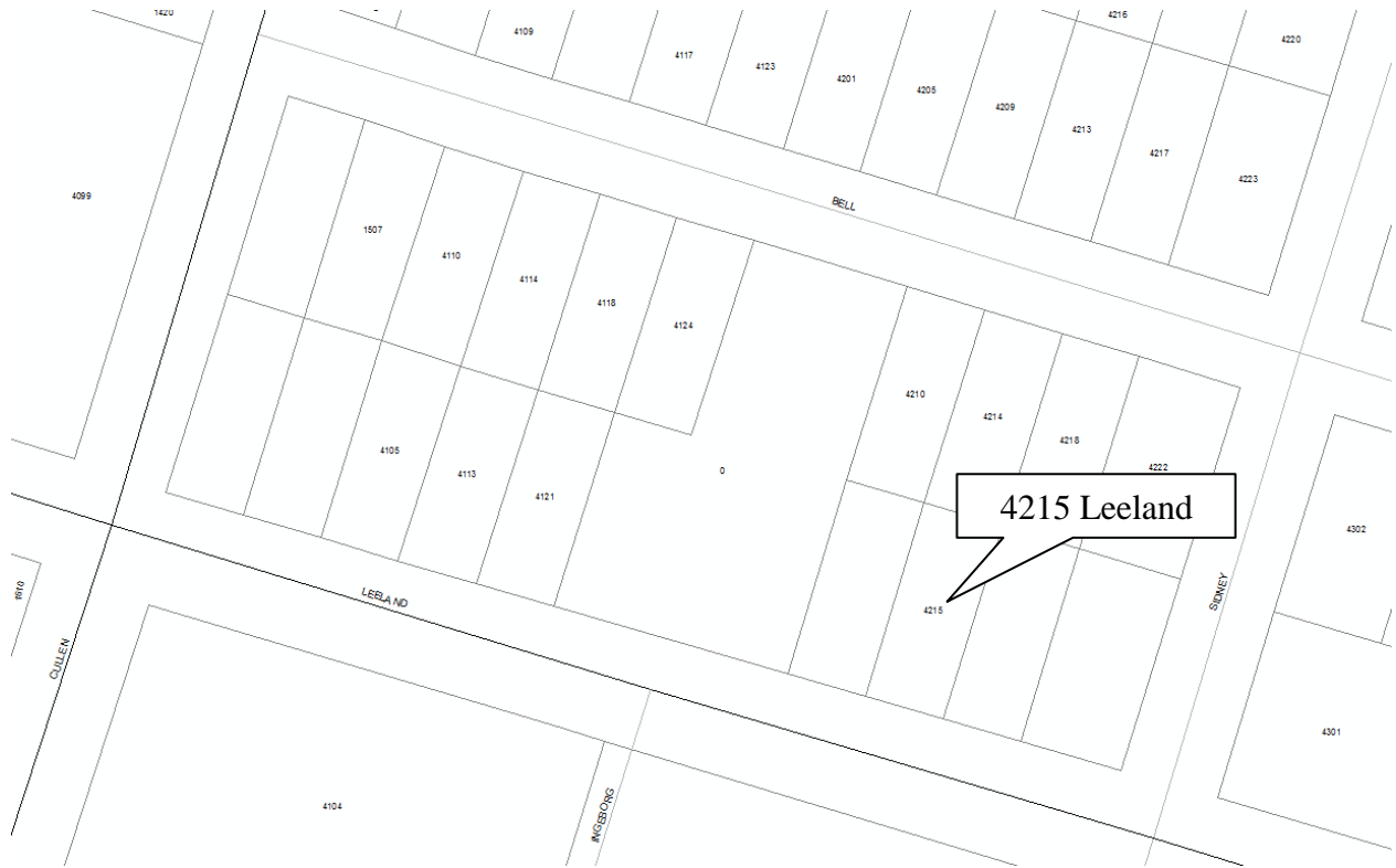
EXHIBIT B SITE MAP EAST END STATE BANK BUILDING 4215 LEELAND STREET