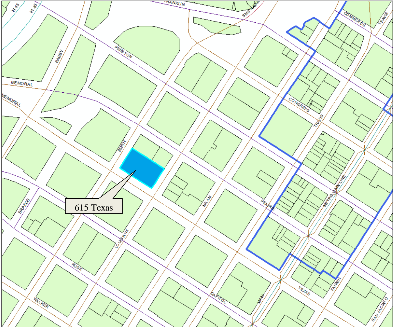
EXHIBIT B ALLEY THEATRE 615 TEXAS AVENUE MAP