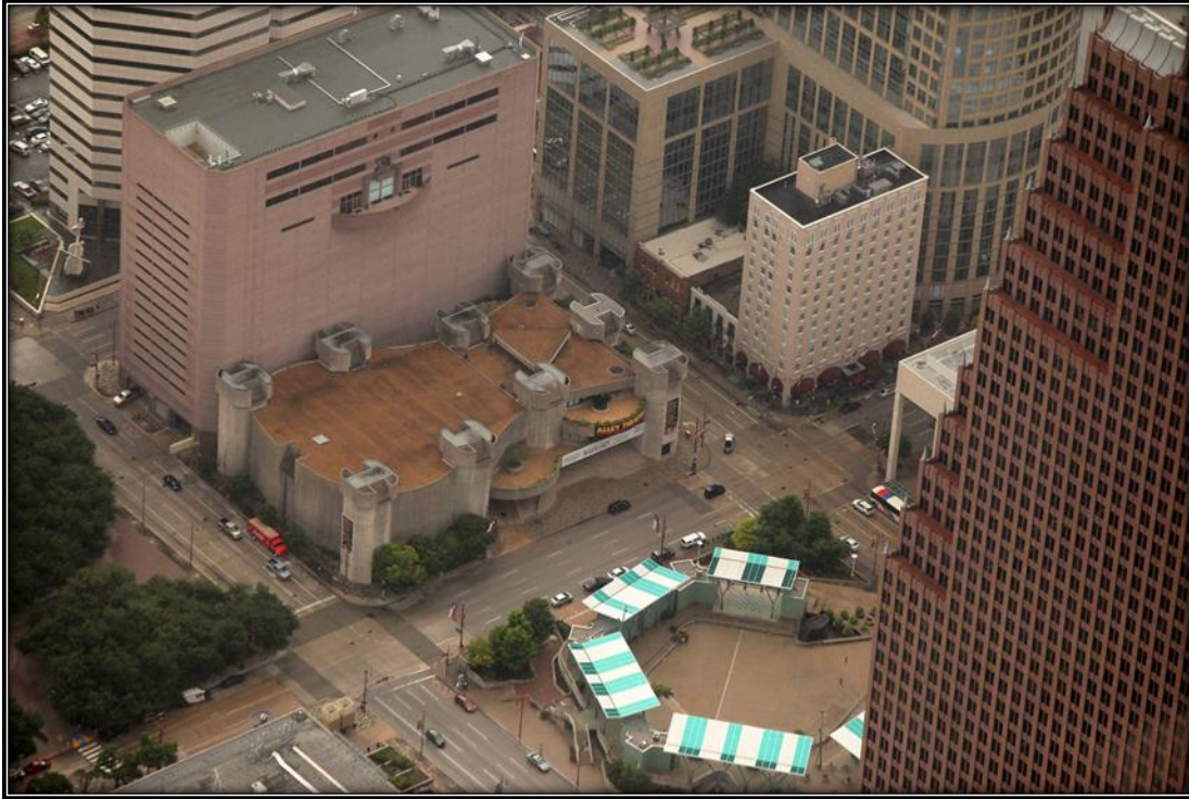
EXHIBIT A ALLEY THEATRE 615 TEXAS AVENUE PHOTOS