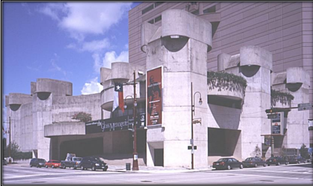
EXHIBIT A ALLEY THEATRE 615 TEXAS AVENUE PHOTOS