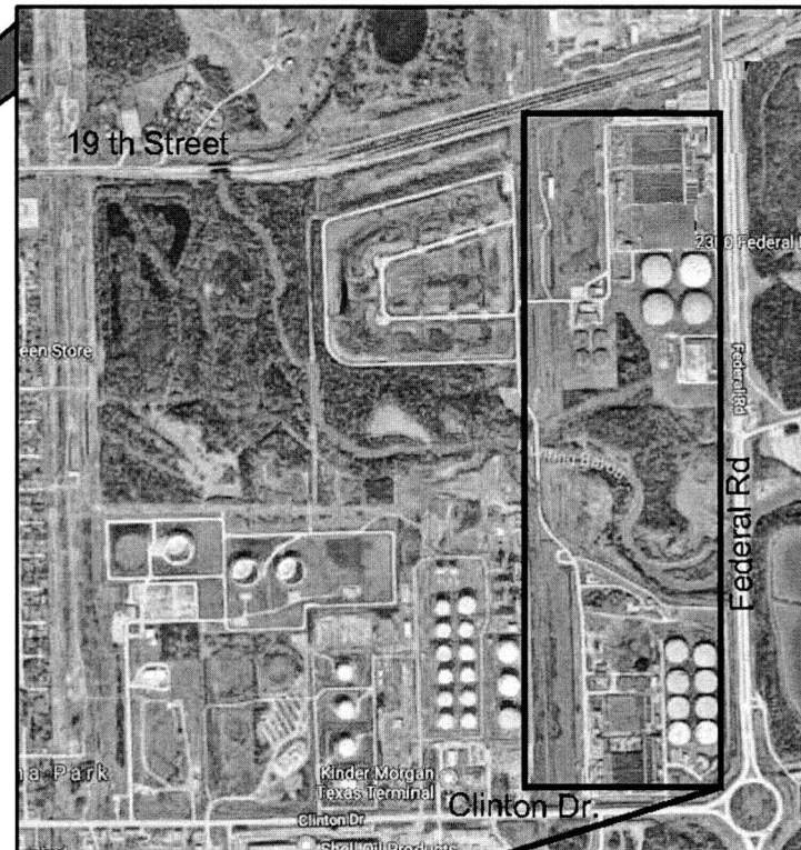
East Water Purification Plant