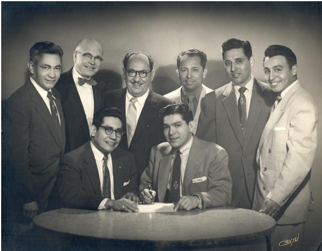
LULAC Council 60 Board of Trustees, 1955.

Signing of the 1955 Council 60 Legal Resolution for the Acquisition of the Clubhouse.