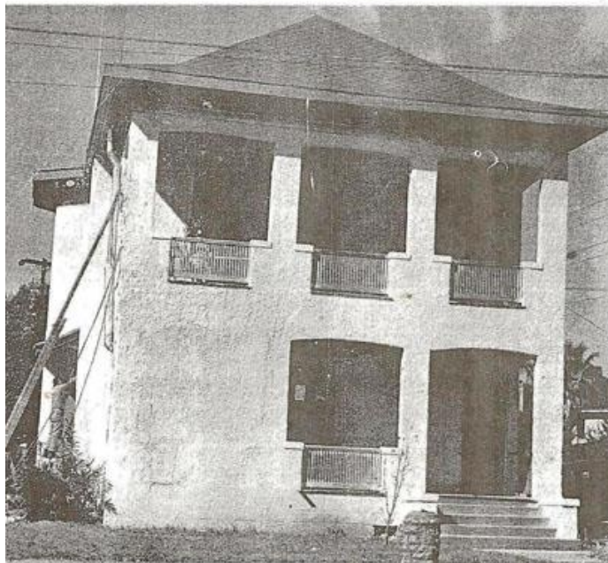
Newly Purchased Clubhouse, 1956.