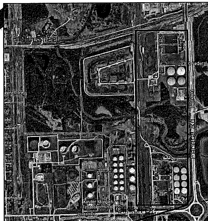
East Water Purification Plant